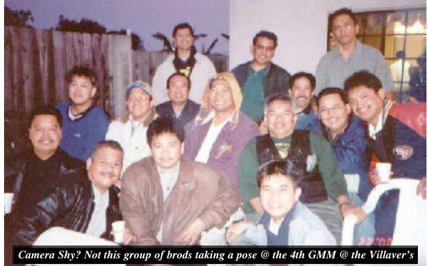
Camera Shy? Not this group of brods taking a pose @ the 4th GMM @ the Villaver's