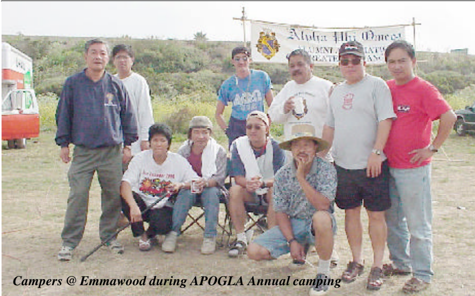
Campers @ Emmawood during APOGLA Annual camping